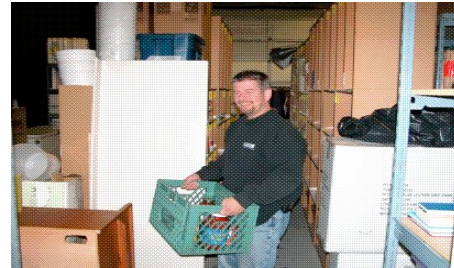
Michael Bible Fellowship Church

ISSUE: 7 WINTER 2006 nightshiftministries.org